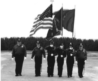
Auxiliary Police Inaugural Color Guard – 2000