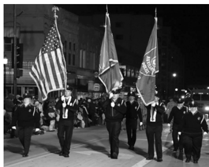
Auxiliary Police Color Guard – 2013