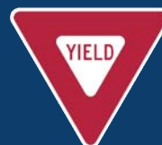
Yield to all traffic in the roundabout.