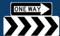
Roundabout traffic travels one-way.